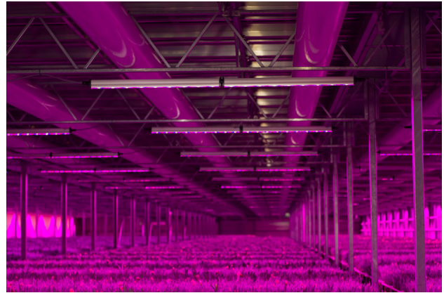
FL100 installation in Holland