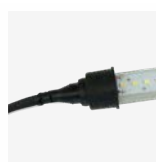
Optional (IP65) single

Optional Valoya end-cap set with ingress protection available to order.