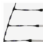
Optional (IP65) chain up to 189 luminaires with 1 mains cable